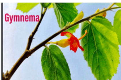
Figure 1: G. sylvestre parent plant

A vulnerable species, G. sylvestre (Asclepiadaceae), is indeed a slow-growing perennial medicinal wood climber endemic to central and peninsular India. A 5-year-old parental plant is shown in Figure 1. It's a powerful anti-diabetic plant that's been used in ancient, ayurveda, as well as homoeopathic medicine for millennia. Asthma, eye problems, inflammations, family planning, and snakebite are all treated with it. Hepatoprotective, antihypercholesterolemic, antibacterial, as well as sweet-suppressing activities too are present. It's also been used in skin treatments, as just a feed intake inhibitor for caterpillar Prodenia eridania , and also to minimize Streptococcus mutans -caused dental caries.