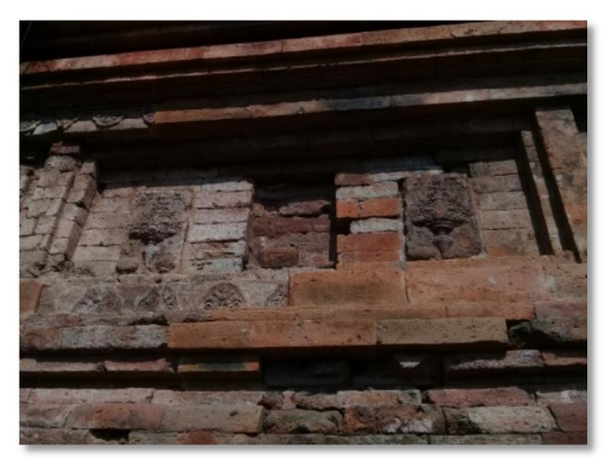
Figure 4. Relief Section of Gunung Gangsir Temple

Gunung Gangsir Temple has reliefs and statues carved into the temple walls. When it was discovered, the structure of the temple was already due to old age. Even so, this temple has a very high artistic and cultural value, so that during the Indonesian occupation, the Japanese took paintings or reliefs and some statues were taken and sold for the benefit of the Great East Asia War (Nur Jannah, interview on 25 January 2017). In the years 2003 to 2013, the surrounding population made their own pemolangan without knowing basic knowledge about the concept of temple restoration. Therefore, there are many reliefs that do not fit the niche. Even at the time of the restoration, many diggers found gold and sold it for personal gain. After the restoration was completed a few years ago many lost statues were stolen by irresponsible people. In order to prevent damage or loss of paintings or reliefs, some of the reliefs released from the recesses are stored in a warehouse (Nur Jannah, interview on 25 January 2017).