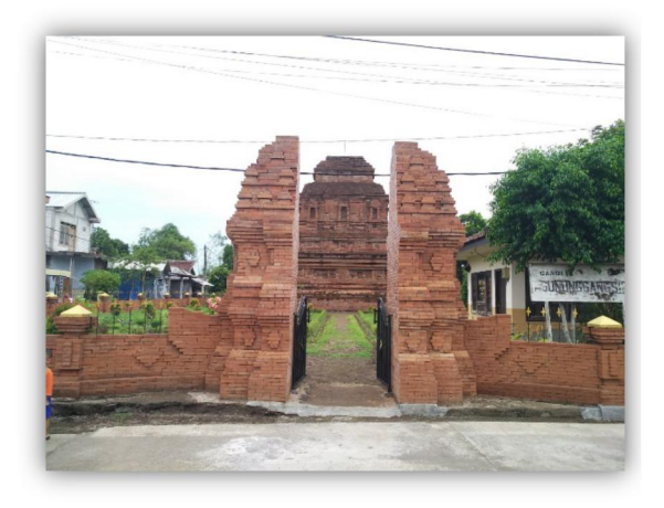
Figure 1. The front of the temple

Gunung Gangsir Temple is unique in terms of its architectural form, which is characterized by the building styles of Central Java and East Java. Central Java langgam temple has the following characteristics, namely the form of a tiled with terraces, the reliefs arise rather high with naturalist paintings in the form of plants or animals, the top of the temple is in the form of stupa, made of andesite stone, the main temple is lying in the middle of the yard and the temple faces east. Examples of temples in Central Java are Mendut, Kalasan and Borobudur. The East Java Temple has the following characteristics, it has a slender shape and a terraced roof, the reliefs appear slightly and the decoration resembles a shadow puppet, the top of the cubeshaped temple, the structure is made of bricks, the main temple is located behind the courtyard and faces west (Atsania, 2016).