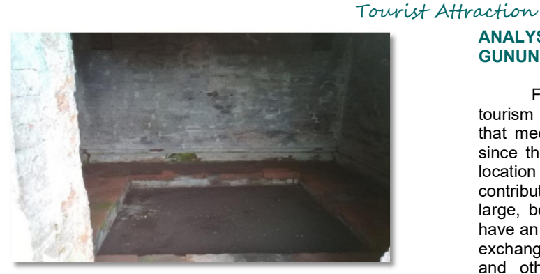
Figure 3. The inside of Gunung Gangsir Temple

Gunung Gangsir Temple has reliefs and statues carved into the temple walls. When it was discovered, the structure of the temple was already due to old age. Even so, this temple has a very high artistic and cultural value, so that during the Indonesian occupation, the Japanese took paintings or reliefs and some statues were taken and sold for the benefit of the Great East Asia War (Nur Jannah, interview on 25 January 2017). In the years 2003 to 2013, the surrounding population made their own pemolangan without knowing basic knowledge about the concept of temple restoration. Therefore, there are many reliefs that do not fit the niche. Even at the time of the restoration, many diggers found gold and sold it for personal gain. After the restoration was completed a few years ago many lost statues were stolen by irresponsible people. In order to prevent damage or loss of paintings or reliefs, some of the reliefs released from the recesses are stored in a warehouse (Nur Jannah, interview on 25 January 2017).