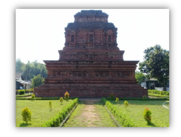
Figure 2. The back of the temple

Gunung Gangsir Temple has the following characteristics: namely a temple in the form of a tiled and staircase with a cube-shaped peak; reliefs arise rather high and ornate naturalist paintings and there are like shadow puppets, it is seen from two reliefs that depict a man and woman whose head disappeared; reliefs affixed to the recesses around the temple; the temple faces west; and temple structures made of bricks (As shown in Figure 1 and Figure 2.).