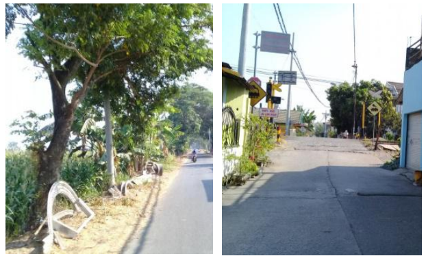
Figure 9. Condition of access road to Gunung Gangsir Temple

location of the object is 20 meters, so it is enough to walk. But for tourists who drive private vehicles can be parked directly around the object. In addition, access to the Gunung Gangsir Temple can also be reached via city transportation or public buses as well as offline and online motorcycle taxis, so that tourists who come to these locations have no access difficulties (Observation, January 25, 2020).