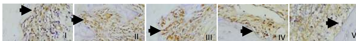
Figure 7: The arrows showed the OPG expression on immunohistochemical observation on the 14th day at the group I, II, III, IV, and V