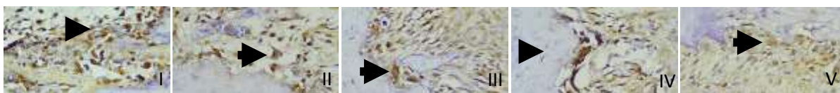
Figure 4: The arrows showed the RANKL expression on immunohistochemical observation on the 14th day at the group I, II, III, IV, and V