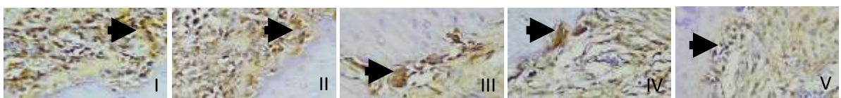
Figure 5: The arrows showed the RANKL expression on immunohistochemical observation on the 21st day at the group I, II, III, IV, and V