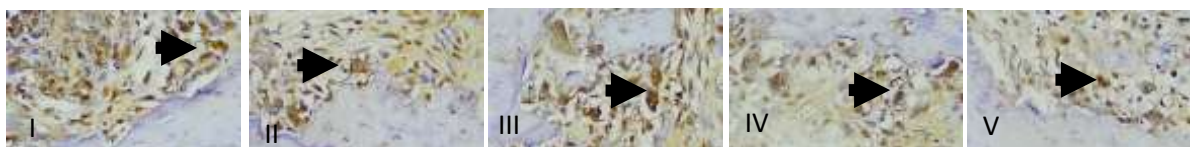
Figure 3: The arrows showed the RANKL expression on immunohistochemical observation on the 7th day at the group I, II, III, IV, and V.

increase in OPG expression. In contrast to the expression of RANKL immunohistochemical observations days 7, 14, and 21, all groups descriptively decreased.