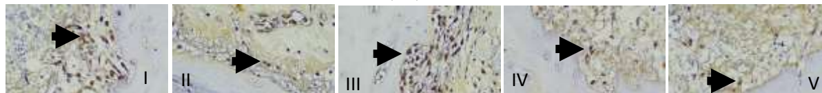
Figure 6: The arrows showed the OPG expression on immunohistochemical observation on the 7th day at the group I, II, III, IV, and V