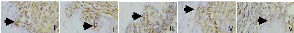
Figure 8: The arrows showed the OPG expression on immunohistochemical observation on the 21st day at the group I, II, III, IV, and V