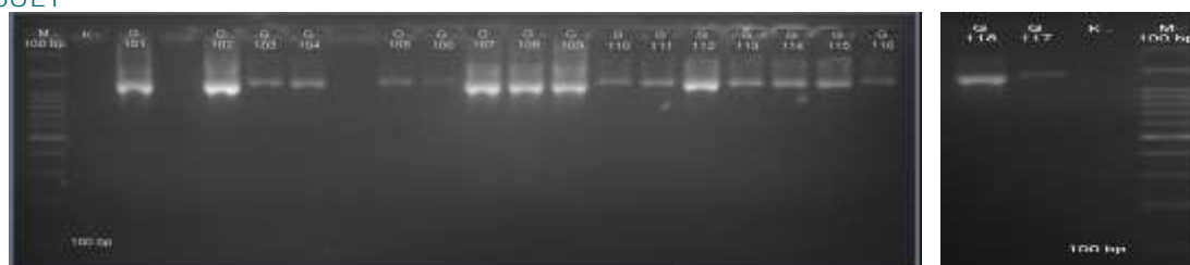
Figure 1: Electrophoresis results of PCR amplification of Granulicatella adiacens samples in periodontitis patients

The study used PCR targeting the 16S rRNA gene for the detection of bacterial DNA. From the PCR amplification results obtained DNA band fragments of 100 bp in all isolation samples. Then proceed with the DNA sequence