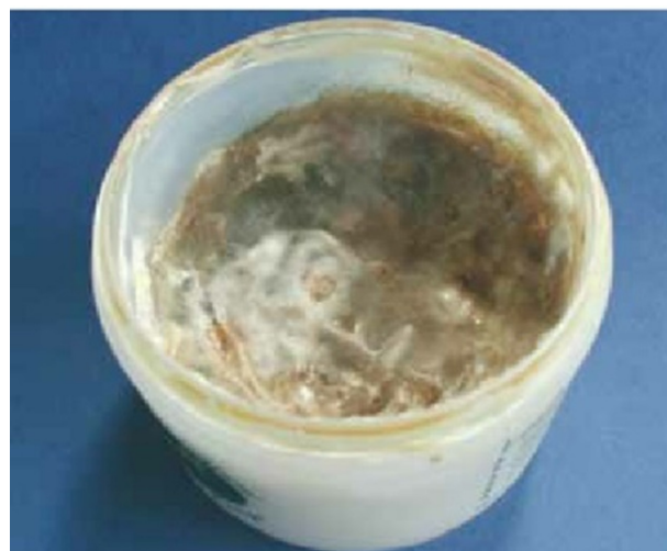
Figure 5: Contaminated creams