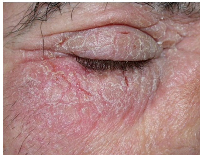
Figure 6: Allergic contact dermatitis caused by contaminated cosmetic products