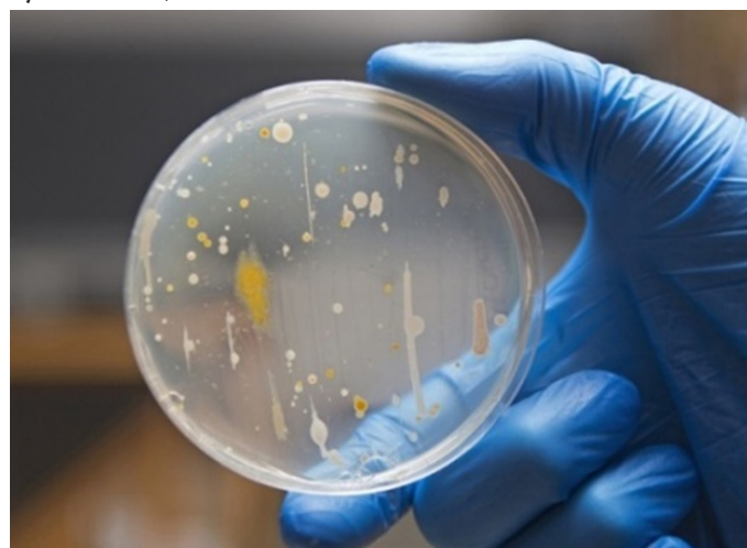
Figure 4: Cosmetic microbiological purity testing in laboratory