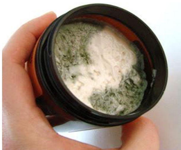
Figure 3: Cosmetic contamination due to preservatives (formaldehyde releasers)