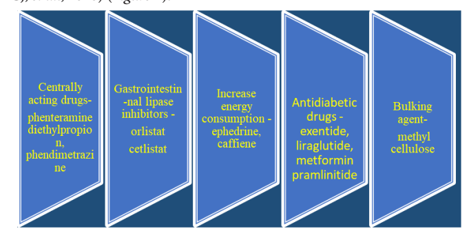
Figure 2: Obesity drug classification

The treatment of obesity by means of medication has withdrawn kind attention from doctors and patients because of shown in improvement of insulin sensitivity, glucose level, lipid level and hypertension in obese patients (Kaplan LM, 2010). The main aim of obesity treatment and management has been to lowered the cardiovascular risk factors so that the overweight and obesity related morbidity and mortality can be reduced. So that use of different medication has given more benefits with reduced mortality and morbidity (Li MF and Cheung BMY, 2011). Anti-obesity drugs can be classified in to following categories: Drugs that reduce fat absorption; centrally acting drugs (anorectic drugs); drugs that increases energy expenditure; antidiabetic drugs and bulking agents (Hendricks EJ, 2017; Rebello CJ, et al., 2018) (Figure 2).