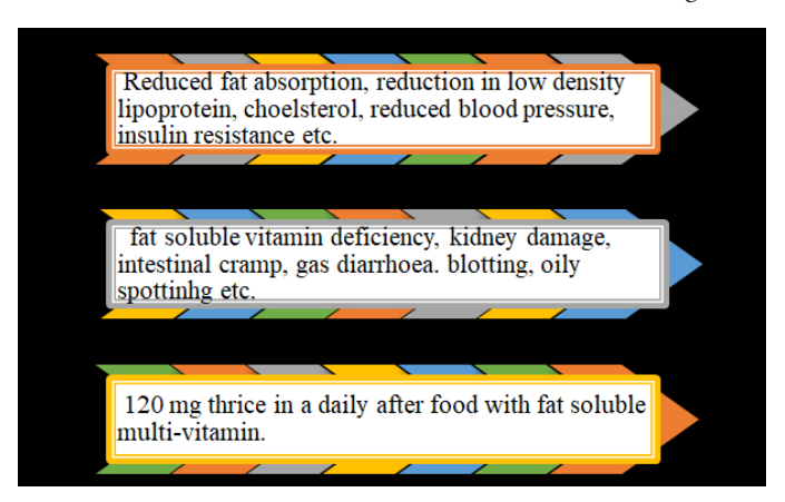
Figure 3: Benefits, adverse effects and dosing of Orlistat Drug increases energy consumption

120 mg capsule with each main meal has been recommended dose of orlistat for adults but should be omitted if a meal was missed. The patients should take, balanced diet which contain 30% calorie from fat (Buse JB, et al. , 2009). But there are some benefits, adverse effects of orlistat ( Figure 3 ).