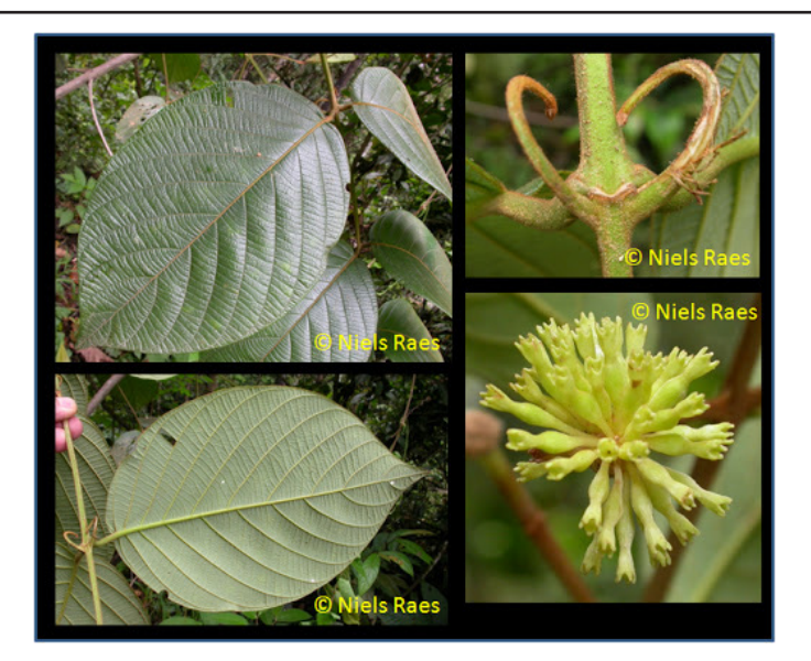
Figure 2: Different parts of Bajakah

Metabolites are substances or compounds of metabolic products produced by an organism (Saroya AS, 2011). The results of the phytochemical tests conducted by Maulina S, et al. , 2019 showed that the extract from the bajakah wood contained more secondary metabolites than the bajakah root. The study also stated that the extract of bajakah wood contains alkaloids, flavonoids, and terpenoids. The test results were reinforced by the research of Zhang Q, et al. , 2015 and Qin N, et al. , 2020 which stated that the secondary metabolites in bajakah contain the highest concentrations of alkaloids, flavonoids, and terpenoids.